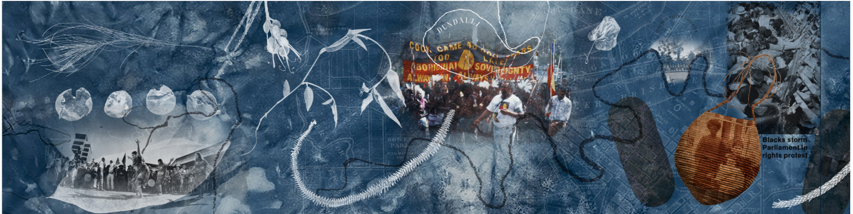
Blacks storm Parliament in rights protest