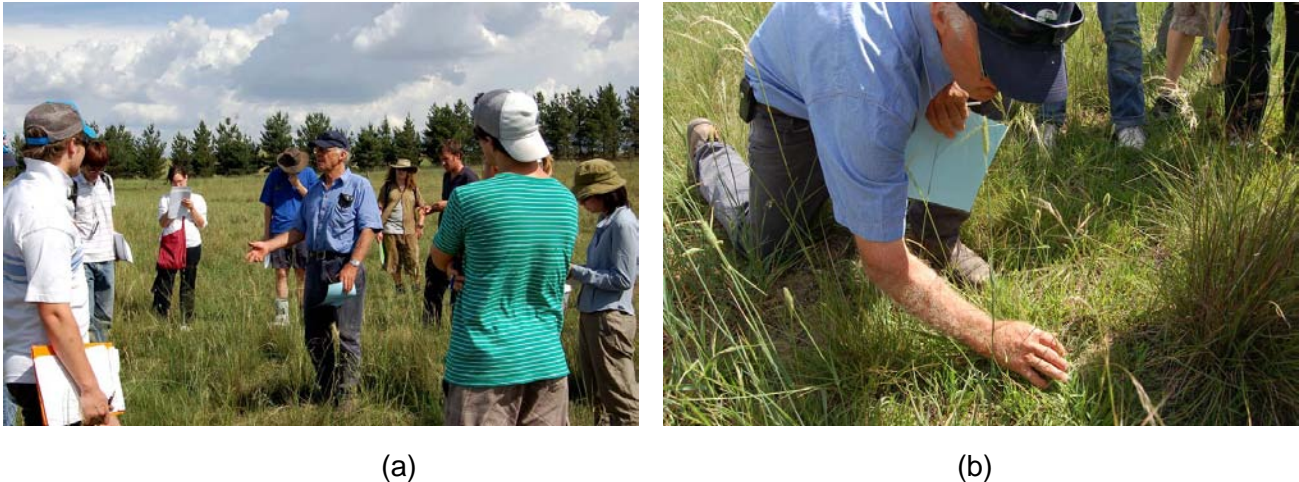
Figure 2.3.2 Time Controlled Grazing on the Grundy Farm, showing a diverse and healthy ground cover

(e.g. repair to fences) the farm has lifted productivity by 30 per cent, now supplying fodder to neighbours. 32