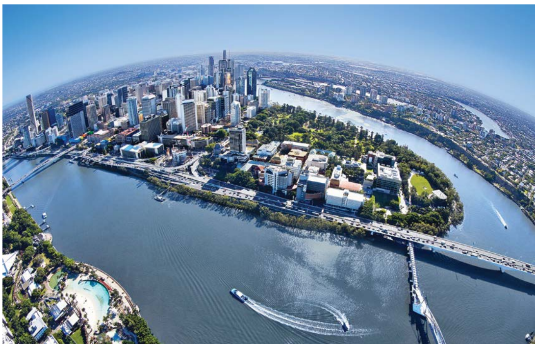
Aerial view of QUT Gardens Point Campus, Brisbane, Australia.

The Crime and Justice Research Centre is a leader in high-impact interdisciplinary criminological research and holds important partnerships with professional and research bodies across Australia and internationally. Launched in 2012, the Centre has a distinctive critical and applied research program, focusing on common challenges that confront citizens, governments and criminal justice systems around the world. The Centre is based at QUT's Gardens Point campus and operates in conjunction with the School of Justice in the Law Faculty.