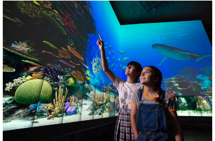
The Living Reef

Dino Zoo is the closest you can get to the real thing, minus the danger of being eaten! Our life-sized dinosaurs are the most scientifically accurate portrayals of these creatures in the world. This project includes digital activities, an archaeological dig simulator, an interactive Earth timeline and more.