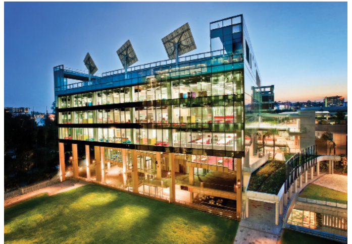
Science & Engineering Centre (P Block)

SEC consists of two multi-storey towers with stimulating learning and research spaces: