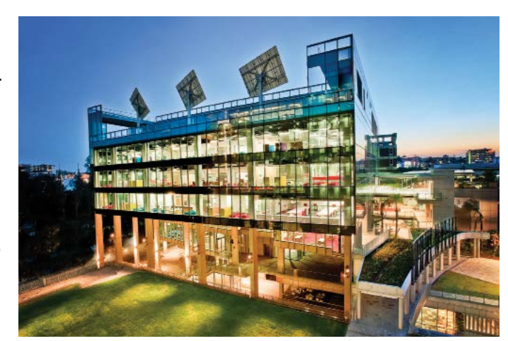
Science & Engineering Centre (P Block)